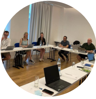
1st training event Cyprus, May 22

During the project, we have organised different events where we presented the project and its results. We held two training events for VET tutors, two final dissemination events, and piloting events in each partner country to test the quality of the materials developed.