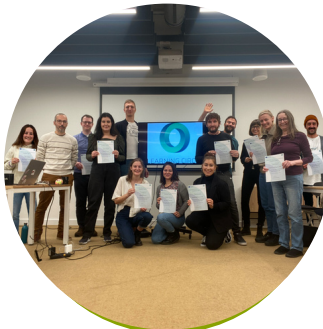
2nd training event Germany, November 22